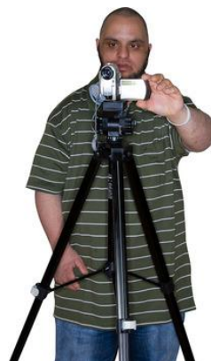
Make a DVD