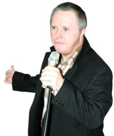
Speak at conferences