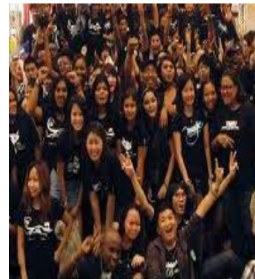
Hand out fliers