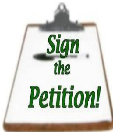
Write a petition