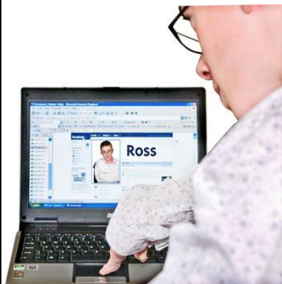
Set up Facebook