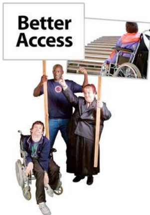
Hold a rally