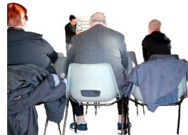
Hold a forum