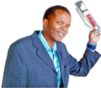
Write a letter to the news editor