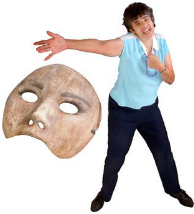
Write a play