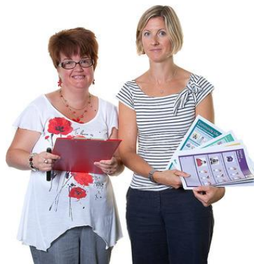
Create an information kit